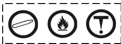
Canadian Hazard Symbols